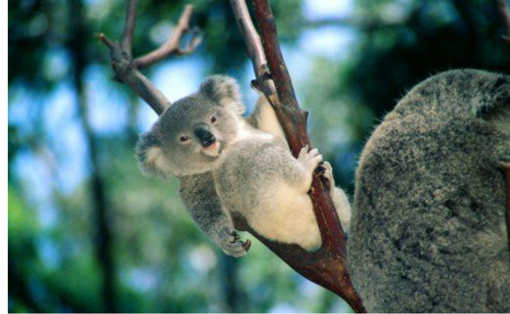
Joey (baby koala)